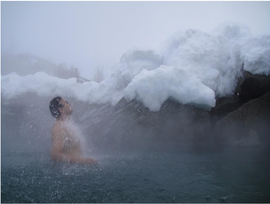
Of course, the hot spring water makes it easy to stand up in the cold air temperature.